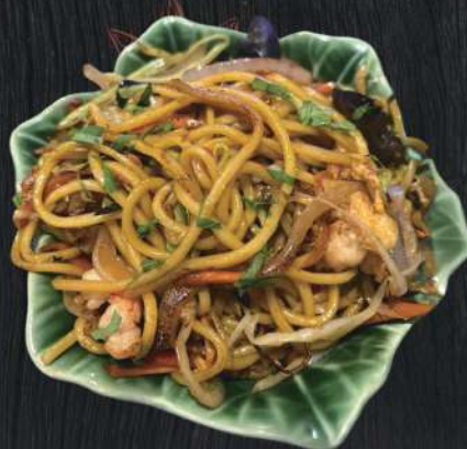
CHICKEN NOODLE (MASSA DE FRANGO)