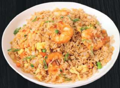
• PRAWN FRIED RICE